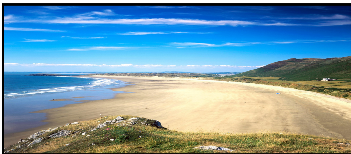
Above: Rhossili beach