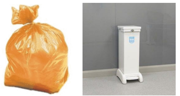
Figure 1 - Orange bag and approved clinical grade bin

All solid infectious waste should be placed into orange bags and placed in white metal flip top clinical grade bins. Each bin must have a Hazardous Infectious Solid Clinical Waste Only sign placed onto it which can be found below.