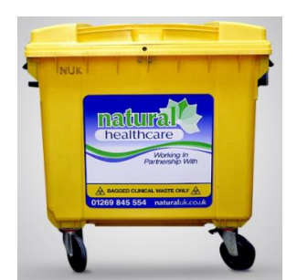
Figure 2 – External yellow bins for temporary storage of orange bags

For disposal, please ensure bags are sealed for transport. Orange bags must be taken back to the following locations;