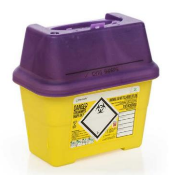
Figure 2 – Example of purple-lidded yellow body box

All solid and sharps waste contaminated with infectious clinical waste and contaminated with cytotoxic and cytostatic substances must be placed into purple-lidded sharps box for disposal.